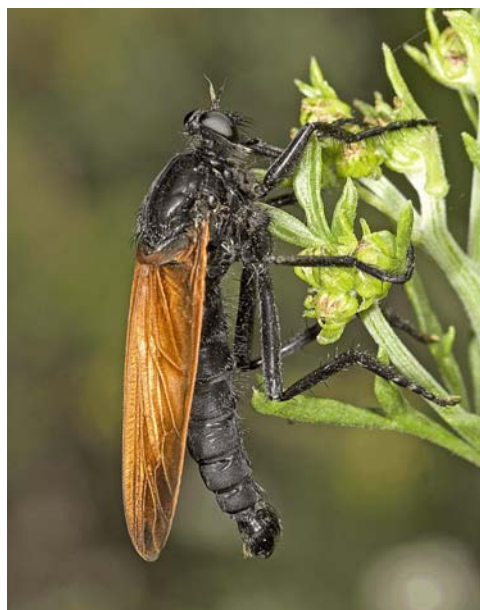
Fig. 1. Wyliea mydas (Asilidae) in Cherry Creek Canyon.

The week before the NADS meeting was a rainy one in southern New Mexico. The area does not benefit from the spring rains that bring a “desert bloom” to the southern portions of California and Arizona. Instead, the most significant rains to drop moisture on the parched lands of southern New Mexico are those of the annual “monsoon”, which typically begins at the end of July and lasts until early September. It is during this brief period of the year that vegetation becomes lush and green, and insects become uncommonly bountiful. The NADS 2007 field meeting was organized to take advantage of this expected peak in insect activity, and the timing proved to be just right. The sky cleared and excellent weather prevailed throughout our four-day meeting. Daily highs in the Silver City area were mostly in the 80s F (high 20s C) during the four days, typical for this higher elevation (6000') town.