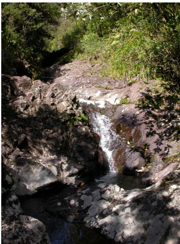
Fig. 1. Webb Stream, Coromandel Forest Park, North Island. Not a New Zealand simuliid habitat.