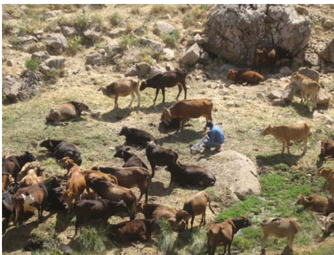
Fig. 1. The author collecting flies on cattle dung in Saral green pastures (Divandarreh, Kurdistan province) while being warmly received by the inhabitants! (July 2007).

I have started working on sphaerocerid fauna of Iran now that I have returned to that country. Despite the recently imposed fuel rations in Iran, I managed to travel to the western provinces of Zanzan, Lorestan and Kurdistan where I was amazed by the Zagros Mountains scenery. The insect fauna of Kurdistan is almost unknown thanks to Iran-Iraq war and armed activities of Kurd separatists in this area. I was able to collect a significant number of sphaerocerids and other saprophagous acalyptrate families (Fig. 1). At the moment, I am removing the specimens from alcohol using HMDS. I am planning to provide an interim report including some of my interesting findings for the next issue of Fly Times .