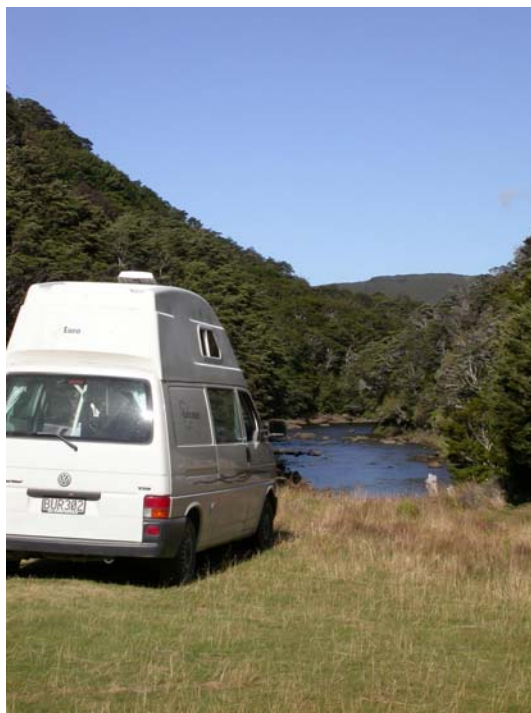
Fig. 5. Primitive(?) camping. Cobb River, NW South Island.

The South Island is in my mind the better place to be, mind you I am biased – I grew up in Nelson, Ruth too. Moreover, there are more species of simuliid there and the geology is quite fascinating. Remember that New Zealand is a small splinter of Gondwana. Indeed, at a place called Curio Cove, between Dunedin and Invercargill, one can walk across a fossilized forest that is of Jurassic age. Hence the title for this article, modified from that of Gibbs’ book regarding the Gondwanan component of New Zealand biota and of which Austrosimulium is one. Well, the genus does occur in Australia and Tasmania and its sister taxon Paraustrosimulium is in South America.