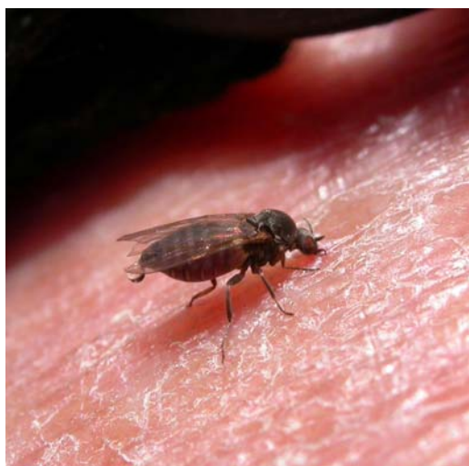
Fig.3. Female Austrosimulium tillyardianum biting the author’s foot.

So, how does one commence a full taxonomic revision of New Zealand Simuliidae? One place to start was the New Zealand Arthropod Collection (NZAC), held in trust as a National Treasure by Landcare, largely in the Tillyard Vault in Auckland (Fig. 4). An interesting place – kept at a constant temperature of around 18°C and with low humidity, one chilled off after a few hours of microscope work. I took to wearing gloves and a toque, but did adapt in the end. Further, the fire suppression system was a bit scary. There is no point having a water sprinkler system in the vault – one might as well let the collection burn. So, instead, the vault floods with a fire suppressant gas. Rules of the game were simple, hear a fire alarm and get your backside out the door and do it within 30 seconds – no questions, just do it! Didn’t happen, but I always wondered.