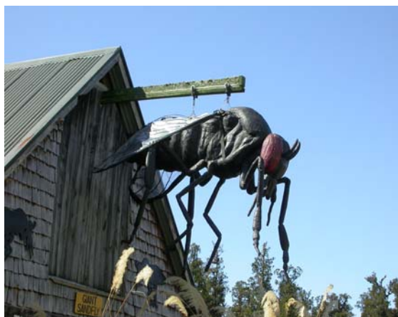
Fig. 2. Giant Sandfly, Pukekura, West Coast, South Island.

includes that song. But how many statues are there? In New Zealand there are at least three, two very fine brass sculptures on the walls of the Tourist Board building at Milford Sound and a monstrous two meter effort at Pukekura on the West Coast (Fig. 2). All startlingly accurate too! Mind you, it is mainly the tourists who go back home and snivel about the attacks of the sandfly adults. Most New Zealanders comment that one should dress more sensibly and slap on repellent. There is a bit of the ‘stiff upper lip – suck it up mate’ involved there too. Also there is a bit of ‘Everybody talks about them, but nobody does anything about them’. Having been well bitten as youngsters, neither Ruth nor I reacted too badly to bites (Fig. 3). I note that Austrosimulium females seem to neither inject much in the way of anaesthetic materials, nor anticoagulants, so one can feel them biting and you don’t bleed too much afterwards – if at all.