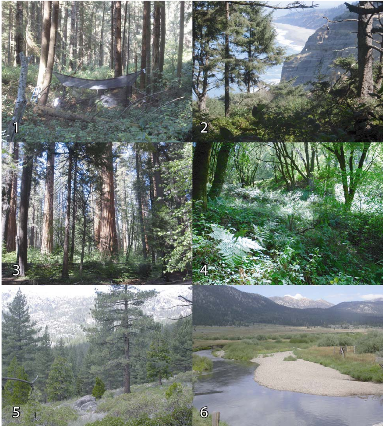
Figs. 1-6. Potential collecting areas in California. 1-2. Patrick's Point State Park, Humboldt County. 3. Calaveras Big Trees State Park, Calaveras County. 4. Annadel State Park, Sonoma County. 5. Grover Hot Springs State Park, Alpine County. 6. Hope Valley near Carson Pass, Sierra Nevada Mountain Range, Alpine County.

Other potential sites. These include Anza Borrego State Park (San Diego County) and the North Bay section of the Coastal Range, which contains a series of parks in eastern Sonoma and western Napa Counties (Annadel State Park – Fig. 4, Sugarloaf Ridge State Park, and Bothe-Napa Valley State Park).