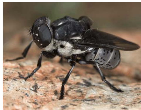
Fig. 2. Cuterebra austeni (Oestridae) on Gomez Peak.