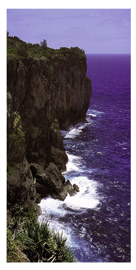
Figure 2. Tongan Trench from cliffs at Lakufa'anga, Southeastern 'Eua, Tonga.

depauperate catch. This was a stream that should have been ideal for larvae of Inseliellum and if in Rarotonga or Polynesia would have yielded a good collection. At the nearby 'sliding rocks' of Heke Stream there were no simuliids either, albeit the site was not as suitable for them. Neither was there anything at the Vaiangana Spring. This last locality, in SE 'Eua, in an area generally termed 'Lakufa'anga', was a 1.5 hr walk along an old lagoon flat above some stunning limestone cliffs with a great view of the Tongan Trench (Fig. 2). The site was a travertine spring arising directly out of a fossil coral cliff (Fig. 3). Not an ideal simuliid habitat, but such does not stop Hebridosimulium larvae occurring in similar water in Espirito Santos, Vanuatu.